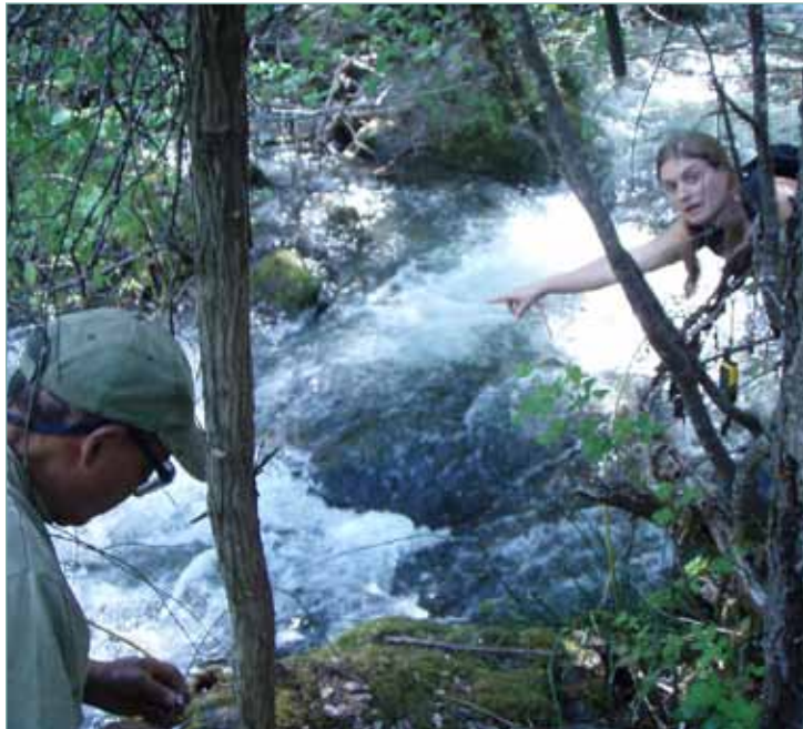
Photo left by Mitzi Rants of a student taking data during a fall Chinook spawning survey.

Water Monitoring: The SRRC and community volunteers monitored water and air temperatures at approximately 50 sites this past summer. In addition to our long term sites, we had a contract with the US Forest Service to help them collect temperature data throughout the watershed for their Klamath National Forest Monitoring Plan. The SRRC has also continued to participate in the collaborative Klamath Basin Monitoring Program to develop and implement a long term monitoring plan for the Klamath and its tributaries, which includes the Salmon River. This program was funded by the US Forest Service and the North Coast Regional Water Quality Control Board.