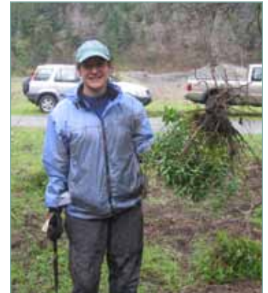
Noxious weeder holding up one of the thousands of oblong spurge plants dug from private land on the Klamath River.