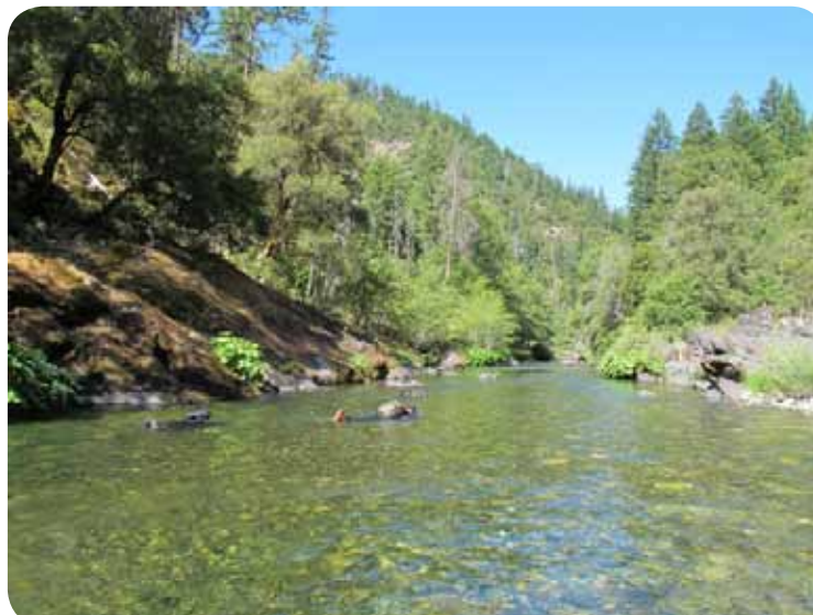
Spring dive 2012

Fisheries: Our fisheries crews have been particularly busy this year. The Klamath River saw one of the largest runs of fall Chinook in recent history. The Salmon River fall Chinook run didn't disappoint. The river and key tributaries were teeming with fish; many reaches were divided in two during spawning surveys, just to manage the sheer volume. It was a great year for fish viewing along the river. We were very excited to see so many salmon - holding, spawning, and returning their nutrients to the river and land. SRRC fisheries crews were joined by Dept. of Fish & Game, Karuk Tribe, US Forest Service, and community volunteers to complete this record fall spawning count. The Spring Chinook Dives were once again a huge success, thanks to nearly 100 volunteers, staff, agency personnel, and fisheries enthusiasts who pitched in this year. The spring Chinook numbers indicate a consistent, strong run over the last couple of years, which we take as a good sign. The population totals were 1291 spring Chinook and 394 summer steelhead.