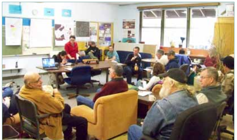
Photo right, SRRC hosting a community input meeting at the Watershed Center for the USFS proposed Jess Project.

The fuels crews are gearing up for the Winter/Spring fuels reduction season. We received a Siskiyou County RAC grant to work in the Wildland Urban Interface (WUI) zone surrounding Sawyers Bar. Having a funded fuels project on USFS lands is a big milestone for us. We hope that this collaboration will lead to more projects in WUI zones. We also received a Grants Clearing House grant to do a Neighborhood Community Wildfire Protection Plan for the Bear Country Neighborhood of Godfrey, Harris, and Blue Ridge Ranches, and surrounding landscape. This year's work was funded by the USFS/Grants Clearinghouse and USFWS.