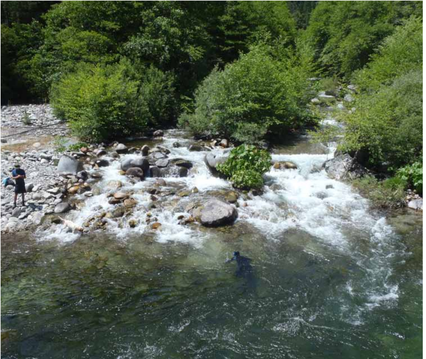
Creek Mouth Enhancement crew looking for fish at the mouth of the Little North Fork