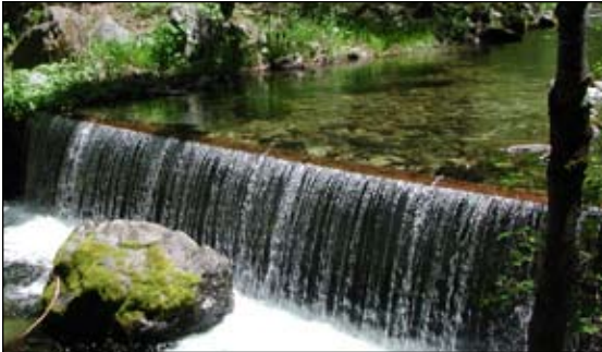
Before and after photos of White Gulch dam removal project.

Salmon River Restoration Council's mission is to restore, maintain, and protect the Salmon River ecosystems through stakeholder collaboration highlighting active community participation and the development of a sustainable economy based on ecological compatibility.